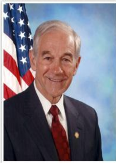
Congressman Ron Paul

Both parties agree that spending must be reduced to prevent this deficit from happening. They disagree, however, about how much and which programs to cut. President Obama's $3.8 trillion proposed budget aims to reduce the deficit by gradually cutting spending over a decade while increasing revenues through higher taxes on the wealthiest Americans, but policy experts who hailed the plan's broad approach to deficit reduction were quick to point out that it does little to address financing entitlements. 10,11 The alternative Republican budget crafted by Representative Paul Ryan (R-WI) reduces spending by $6.2 trillion over a decade, which is achieved in part by reforming and cutting entitlements. 12